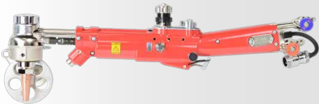
Handy Auto Plus