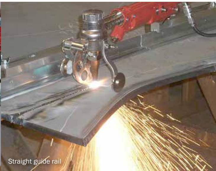
Straight guide rail